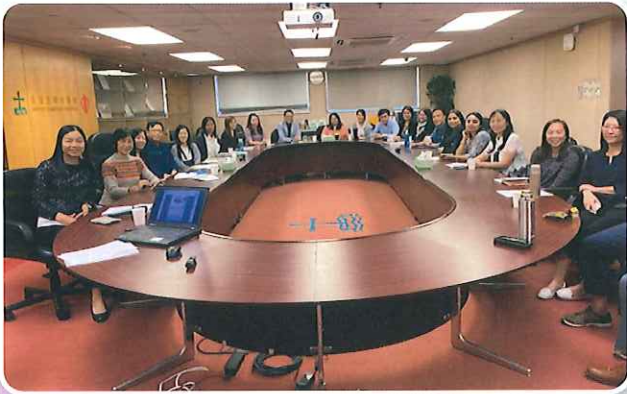
各個服務部門的專業同工於社康的「基層健康學術會議」中就醫療議題互相交流 UCN professional staff from different service units conducted exchanges on medical aspects in "Primary Care in Action" Mini-Conference

除了專業培訓之外，社康亦非常關注同工的身心健康，因而開展了「社康情『員』計劃」，旨在共建健康工作間。自2019年7月起，