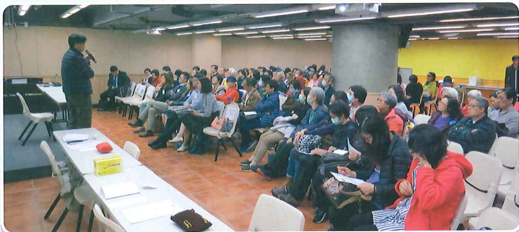
跨專業醫療團隊於「社康與你齊控糖」活動中分享如何防治糖尿病 The trans-disciplinary service units shared the diabetes mellitus prevention and management in "Diabetes Mellitus Day"

The Chinese Medicine Specialty Centre and Community Nutrition Service had co-launched a new "Chinese and Western Medical Weight Management Scheme", which for service users with overweight and obesity to manage their weight by traditional Chinese medicine health care therapy, individual diet counselling and diet menu design. It aimed to prevent and maintain health standard for people suffering from high blood pressure, hyperlipidemia, hyperglycemia, etc.