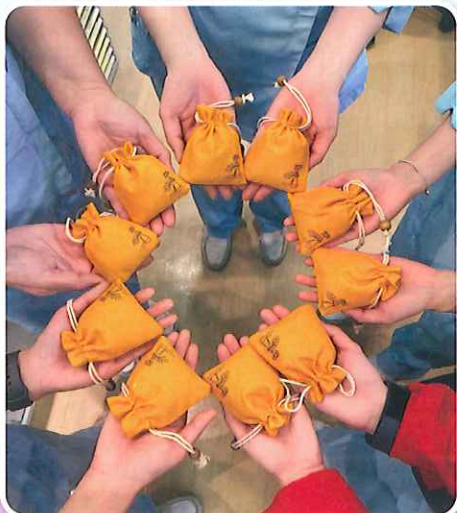
中醫部同工親手製作保健香囊送予社康全體同工，以增強抵抗能力 Sachets were hand-made and distributed to all UCN staff by Chinese Medicine Service which can strengthen the immune system

開設情緒支援熱線，協助同工紓緩壓力；2019 冠狀病毒疫情初期，中醫部同工親手製作保健香囊送予社康全體同工，香囊有抑制細菌和病毒、調節機體免疫系統和預防疾病等作用，深受同工歡迎，不少同工查詢製法欲送贈親朋，有關配方並已上載於 Facebook 與市民大眾分享。