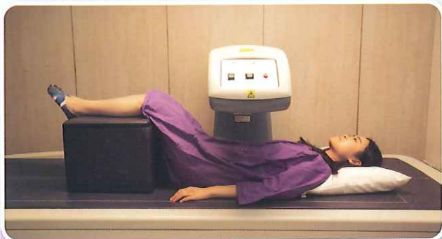
影像診斷服務的雙能量 X 光骨質密度儀測試服務 Dual Energy X-ray Absorptiometry Test provided by the Diagnostic Imaging Service