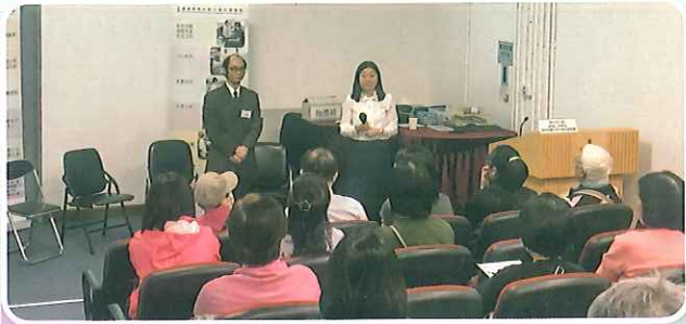
「基督教聯合那打素社康服務醫療中心 - 健康日」中由跨專業醫療團隊講解病症成因及治療方法 The trans-disciplinary service units explained the causes and treatments of the various diseases in "United Christian Nethersole Community Health Service Medical Centre - Health Day"

中醫專科中心又與社區營養服務共同協作推出「中西體重管理計劃」的嶄新跨專業醫療服務，以中醫養生保健療法和個別營養評估及餐單設計，為過重及肥胖人士管理體重，以及預防並為患有高血壓、高血脂、高血糖等人士維持健康水平。