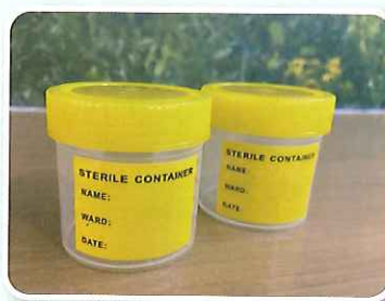
社康轄下診所收集深喉唾液樣本, 以及早識別2019冠狀病毒病懷疑或確診個案 Deep throat saliva specimens were gathered from UCN clinics, in order to diagnose suspected or confirmed COVID-19 cases as soon as possible

UCN closely worked with the health departments of the Government and advocate primary health, such as participating in Influenza Vaccination Subsidy Scheme, Colorectal Cancer Screening Scheme, Smoking Cessation Project for Ethnic Minorities and New Immigrants, etc. UCN clinics co-operates with the Department of Health amid COVID-19 outbreak and join the “Enhanced Laboratory Surveillance Program”, which to diagnose suspected or confirmed cases at early stage and reduce the risk of transmission.