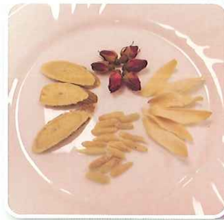
註冊中醫師推介的益氣潤肺 養心茶保健茶 Chinese health tea recommended by registered Chinese Medicine Practitioners

In addition, the Chinese Medicine Specialty Centre cooperated with Alice Ho Miu Ling Nethersole Nursing Home from 1 August 2019 to arrange Chinese Medicine Practitioners to visit the nursing home regularly by providing outreach consultations and acupuncture services for the physically disabled residents.