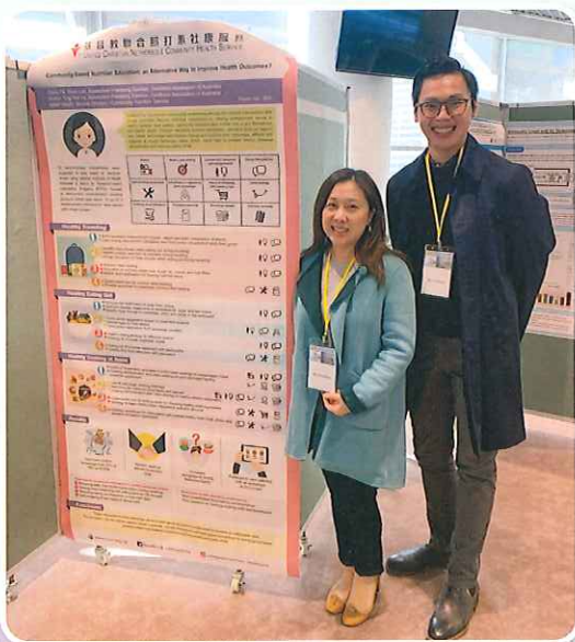
專職醫療服務代表於香港基層醫療會議以社區營養教育為題，分享如何由營養學角度改善個人健康狀況 The representatives of Allied Health Service shared the topic of community nutrition education at the Hong Kong Primary Care Conference on how to improve personal health from the perspective of nutrition