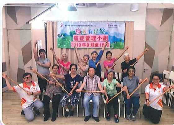
新創建集團慈善基金資助愛鄰網絡（天水圍）的「痛症有出路」及愛鄰網絡（廣福）的「營得喜·活得樂」計劃 NWS Holdings Charities Foundation supported the pain relief workshop and nutrition programme for members of Good Neighbour Network (Tin Shui Wai) and Good Neighbour Network (Kwong Fuk)