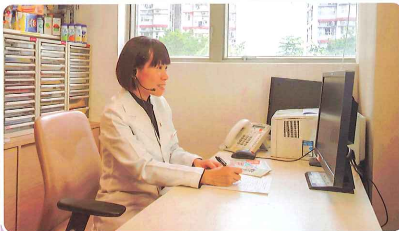
各部門將服務擴展至電話及網上平台，大眾無需受環境的限制，仍能得到健康資訊 Service units extended the scope of service to mobile and online platform, which enabled service users to acquire healthcare information without limitations

The services of UCN had gradually resumed to normal amid the ease of COVID-19 outbreak. In view of the erratic situation of the outbreak, UCN launched telehealth service that became a new normal service model. This enabled service users to receive medical consultations, individual dietetic and emotional health counselling services at home through telephones or mobile applications. Health talks and workshops were organised to companies and NGOs in webinar format, which enabled service units to provide healthcare information without borders and limitations.