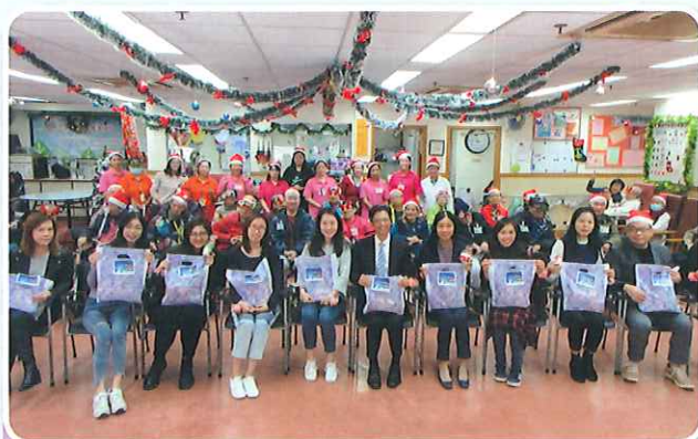
亨達集團的義工與鯉魚門長者日間護理中心的長者共度聖誕佳節 Volunteers from Hantec Group celebrated Christmas with the elderly from Lei Yue Mun Day Care Centre for the Elderly

The volunteers from Alliance Construction Materials Limited visited Good Neighbour Network (Tin Shui Wai) on 11 September 2019 to celebrate Mid-Autumn Festival with the elderly by playing games and delivering gifts, which let them to enjoy the atmosphere of festive and care. On 18 December 2019, the volunteers from Hantec Group organised a Christmas party - "Celebrating Christmas with Hantec Group" for the elderly from Lei Yue Mun Day Care Centre for the Elderly with enormous fun. NWS Holdings Charities Foundation provided financial and manpower support for the pain relief workshop and nutrition program, which members from Good Neighbour Network (Tin Shui Wai) and Good Neighbour Network (Kwong Fuk) were participated in the activities. A total of 273 elderly members were benefited from the three events.