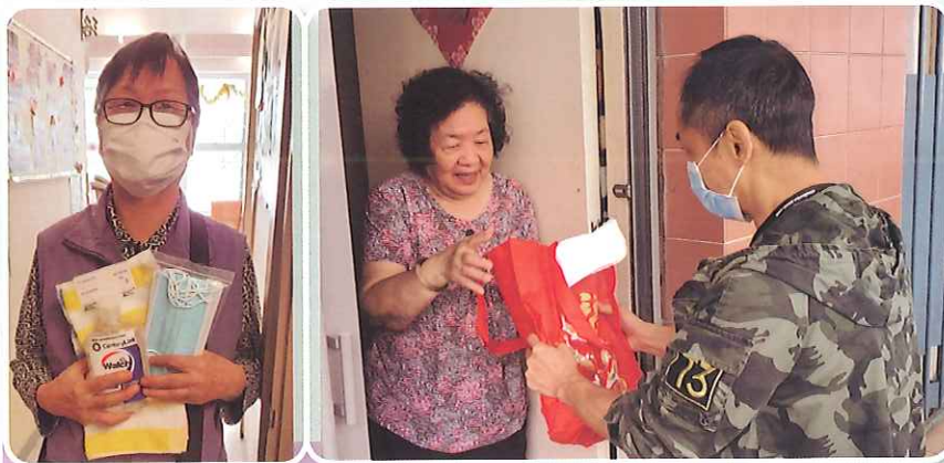
各方機構及熱心人士慷慨捐贈及派發物資予長者 Various donations of goods from organisations and individuals to the elderly

During the early stage of COVID-19 outbreak, due to limited information of the virus, along with the buying surge of hygienic and livelihood commodities, which caused panic to the society, especially for those underprivileged like elderly and ethnic minorities. Indebted to generous donation from organisations and individuals, UCN distributed hygienic and consumable goods to elderly and ethnic minorities from January to March 2020. Besides distribution of goods, UCN also mobilized volunteers to provide health education information via phone, which help them stay home and stay safe.