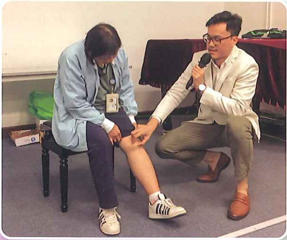
註冊中醫師於「如何提升身心治療－中醫篇」中向聯合醫院同工示範穴位按摩 Registered Chinese Medicine Practitioner demonstrated acupressure massage to the staff from the United Christian Hospital in "How to Improve Physical and Mental Treatment-Chinese Medicine" activity

此外，中醫專科中心於2019年8月1日起，與雅麗氏何妙齡那打素護理院合作，安排中醫師定期前往院舍，為行動不便的院友，提供外展中醫診症及針灸等服務。