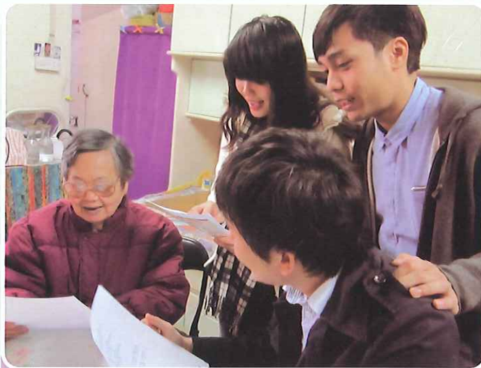
愛鄰網絡（廣福）與香港中文大學醫學院那打素護理學院合作，讓老年學課程學生透過家訪，了解長者的需要，並提供相應的支援 Good Neighbour Network (Kwong Fuk) cooperated with The Nethersole School of Nursing, Faculty of Medicine, The Chinese University of Hong Kong to arrange students from gerontology program to understand elders' needs and provide support through home visits

愛鄰網絡（廣福）與香港中文大學醫學院那打素護理學院合作，於2019年9至11月期間，安排老年學課程學生透過家訪，與患有慢性病的長者會員及其照顧者建立良好的溝通關係，了解他們的需要，並提供支援，從而促進跨代共融。