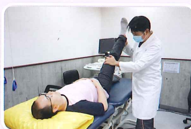
社區復康服務由專業的物理治療師及職業治療師組成，設於醫療中心五樓，提供一站式復康治療服務 The physiotherapist and occupational therapist and Community Rehabilitation Service at 5/F of the Medical Centre offers one-stop rehabilitation service