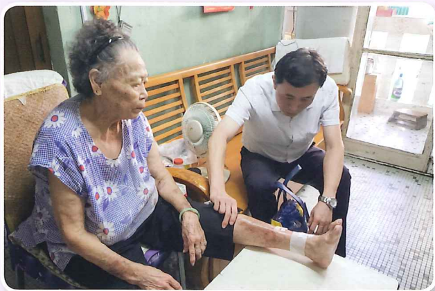
預防醫學及醫療服務團隊獲得香港賽馬會慈善信託基金的支持，推出了「賽馬會樂活長者『健』社區」計劃 With the support from The Hong Kong Jockey Club Charities Trust, PMCS launched "Jockey Club District Primary Care Program for the Elderly"

社區營養服務由註冊營養師主理，除了提供個別飲食輔導、營養教育及烹飪小組等服務外，近年亦開拓了外展服務至長者院舍，6 所協作院舍分別位於觀塘、將軍澳、九龍灣、屯門及港島區。除了為長者及其家人提供預防、治療及復康期間的適切營養輔導，我們亦為院舍的餐膳進行專業評估，包括編寫循環餐單、每餐標準份量、標準化食譜及特別餐，如糖尿餐/糊餐安排等；另會為院舍廚師、前線員工及專職醫療同工等舉辦培訓學堂，以改善餐膳供應，協助社福機構長遠改善院舍長者的膳食質素及健康。