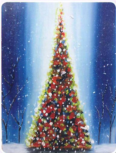
長者集體繪製了一幅油畫送給亨達集團作紀念品 Elderly painted a picture together as a souvenir for Hantec Group