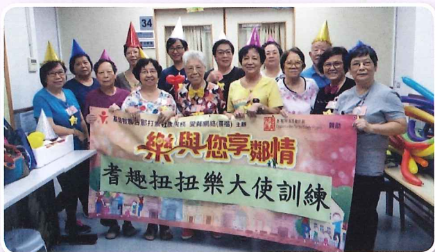
「老有所為活動計劃」中的扭汽球活動 Balloon twisting class from “Opportunities for the Elderly Project”