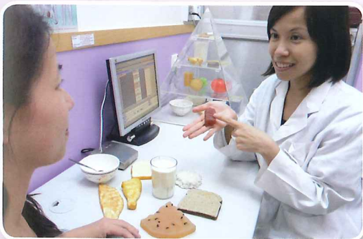
社區營養服務設於醫療中心五樓，由註冊營養師主理，旨在為社區人士提供正確營養資訊，加強公眾對健康飲食的認識 The registered dietitians of the Community Nutrition Service, situated at 5/F of the Medical Centre, provide nutrition education to raise public awareness on healthy diet