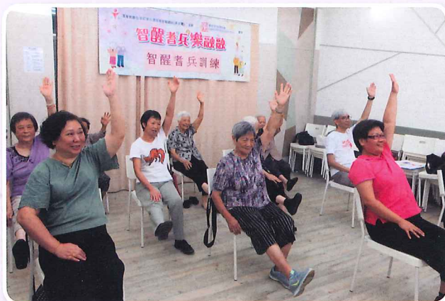
社會服務部獲得社會福利署撥款，於愛鄰網絡3個單位(廣福、秀茂坪及天水圍)及鯉魚門長者日間護理中心推行4項「老有所為活動計劃」 Social Service was granted from Social Welfare Department for 4 projects of “Opportunities for the Elderly Project” launched in 3 Good Neighbour Network (Kwong Fuk, Sau Mau Ping and Tin Shui Wai) and Lei Yue Mun Day Care Centre for the Elderly