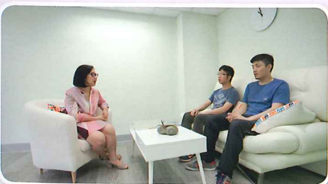
醫療中心五樓的聯合情緒健康教育中心由經驗豐富的臨床心理學家及輔導員主理 United Centre of Emotional Health and Positive Living at 5/F of the Medical Centre was managed by experienced clinical psychologists and counsellors