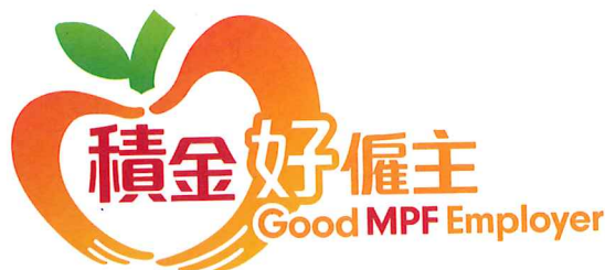
社康獲得由強制性公積金計劃管理局頒發的「積金好僱主」獎項 UCN received the award of "Good MPF Employer" from Mandatory Provident Fund

另外，我們亦獲得由社區投資共享基金頒發的「社會資本動力標誌獎」，以表揚我們共同凝聚跨界別力量，共建人情味香港；以及由社會福利署頒贈之「義務工作嘉許狀(團隊)-金狀」，以認同社康積極參與義務工作，為社會上有需要人士提供服務，協助建設一個更見關懷及和諧共融的社區。