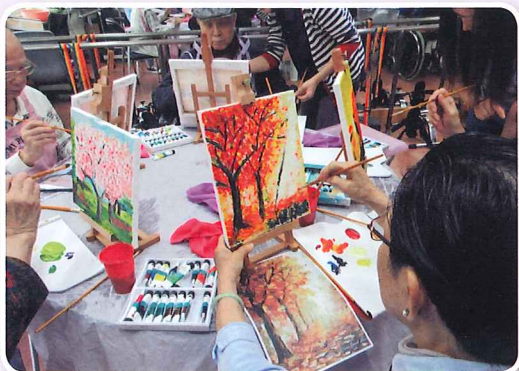
「老有所為活動計劃」透過不同類型的活動，例如西洋畫班以實踐老有所為的精神 “Opportunities for the Elderly Project” hosted various activities, such as painting class to cultivate a sense of self-worthiness for the elderly

Social Service was granted from Social Welfare Department for 4 projects of “Opportunities for the Elderly Project” launched in Good Neighbour Network (Kwong Fuk, Sau Mau Ping and Tin Shui Wai) and Lei Yue Mun Day Care Centre for the Elderly. These projects aimed to enrich elderly's life experience, widen their social network and encourage them to serve others through various activities in order to unleash their potential. There were a lot of activities held including painting class, praise dance, Laughter Yoga, brain gym games, balloon twisting, visits to kindergarten and elderly home. Participants not only enjoyed the activities, but also cultivated a sense of self-worthiness by contributing to community in their late stage of life. There were 1,443 beneficiaries in these projects.