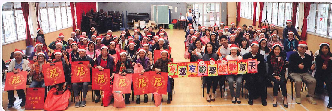
友盟建築材料有限公司的義工和愛鄰網絡(廣福)的長者一同慶祝聖誕節 The volunteers of Alliance Construction Materials Limited celebrated Christmas with members of KFGNN

United Christian Nethersole Community Health Service