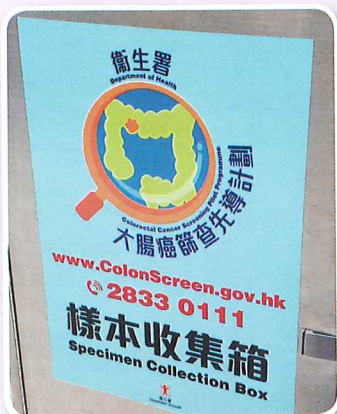
社康與衛生署緊密合作，進行大腸癌篩查健康檢查計劃 UCN collaborated with Department of Health for the Colorectal Cancer Screening Program

為了提高商用車司機的健康意識，運輸署舉辦了「至 fit 安全駕駛大行動」，鼓勵司機注意及維持良好的健康狀況，以確保道路的安全。自 2011 至 12 開始，社康連續 7 年成為此商用車司機健康檢查計劃的服務提供機構，司機的參與率連年遞增。今年，共約 1,900 名商用車司機，在機構轄下的 4 個健康中心進行了健康檢查。