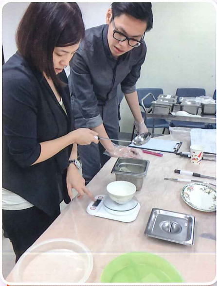
社區營養外展服務包括營養諮詢、營養講座、體重控制、閱讀食物標籤及烹飪小組等 Outreach nutrition service offers dietetic consultation, nutrition seminars, weight management, food labels reading and cooking classes