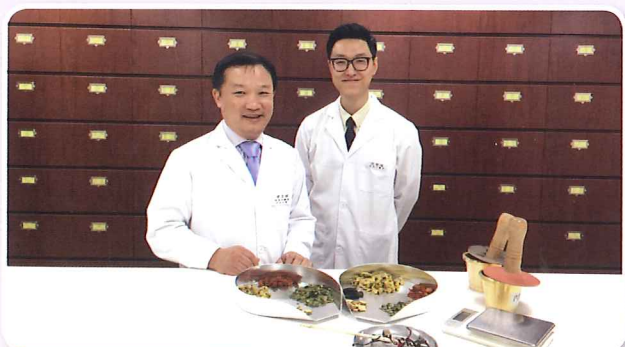
中醫專科醫療中心設於三樓，由擁有博士 / 碩士 / 專科培訓醫師主診 Situated at 3/F of UCN Medical Centre, Chinese Medicine Specialty Centre were staffed with Chinese medicine practitioners with doctoral/ master/ specialist qualifications