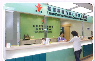
佐敦健康中心於 2018 年 4 月完成翻新工程 The renovation works of Jordan Health Centre was completed in April 2018