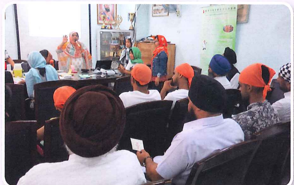
少數族裔人士健康服務進行基層健康講座 Ethnic Minority Health Service conducted primary health seminar