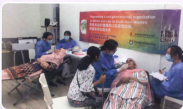
少數族裔人士健康服務提供外展健康檢查服務 Ethnic Minority Health Service provided outreach health screening service