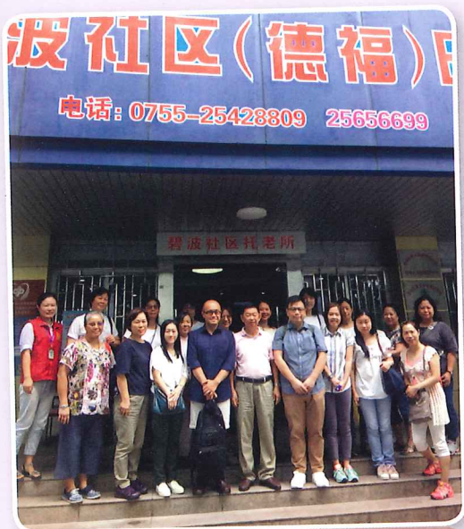
社會服務部首次舉辦了深圳長者服務考察團 Social Service organised the first study tour to Shenzhen elderly service units

參加考察團的同工均是第一次探訪深圳的長者服務單位，是次考察增加了他們對內地長者服務的認識，獲益良多；透過與深圳服務人員的交流，更深入了解港深兩地長者服務的特色。