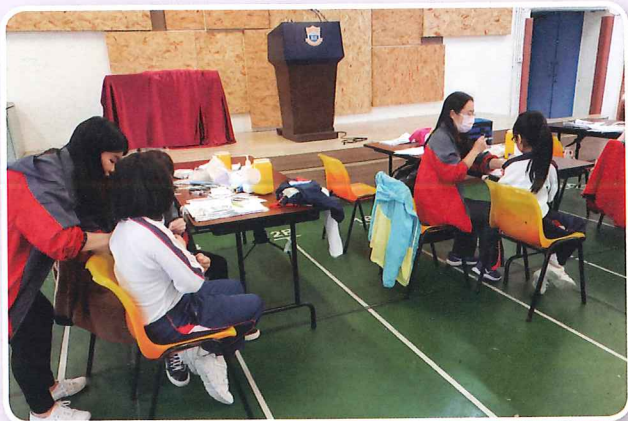
外展服務隊為小學生提供免費到校的流感疫苗接種服務 Outreach service team provided free on-site flu vaccination to primary school students

為了推動基層健康的重要性，社康的預防醫學及醫療服務團隊一向積極與各政府部門協作開展了多個合作項目。其中最重要的一項是流感疫苗注射服務，而本年度的計劃已於 2018 年 10 月 2 日開始進行，截至 2019 年 3 月 31 日，接種疫苗由上年度的 5 萬餘劑大幅增至逾 6 萬劑，其中超過 70% 由外展服務隊完成。我們亦參加了衛生署的試驗計劃，為接近 7,000 名小學生提供免費到校的接種服務。2019 年到校接種計劃將擴展至幼兒園，相信來年可服務更多兒童及青少年。