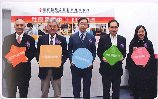
社康醫療中心於 2019 年 1 月 24 日舉行開幕典禮 The Opening Ceremony of the UCN Medical Centre was held on 24 January 2019

位於觀塘的聯合醫院 J 座、全新的社康醫療中心於 2018 年逐步投入服務，更於 2019 年 1 月 24 日舉行了開幕典禮，我們邀請了食物及衛生局地區康健中心總監胡仰基先生作主禮嘉賓，並有一百多位嘉賓到場見證我們向前邁進新的一頁。儀式結束後，嘉賓到各樓層參觀醫療中心內的不同服務範疇。