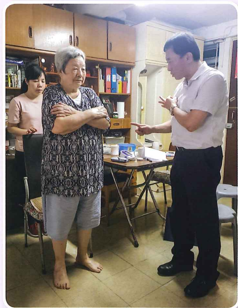
「賽馬會樂活長者『健』社區」計劃由專業醫療團隊對長者進行家訪及基本健康評估 The professional team of the "Jockey Club District Primary Care Program for the Elderly" conducted home visits and basic health assessment for the elderly

Besides individual nutrition counselling, nutrition education, and cooking classes, the registered dietitians of Community Nutrition Service, also outreached to 6 elderly residential homes located in Kwun Tong, Tseung Kwan O, Kowloon Bay, Tuen Mun and Hong Kong Island. Apart from individual nutrition therapy and dietetic consultation for residents and carers, professional advice for improvement of catering service was also provided. Areas included menu planning, standardization of serving sizes, special diets and texture modified diets, etc. Our dietitians also regularly conducted train-the-trainer workshops for their frontline staff, health professionals and chefs to improve their nutrition skills and knowledge, aiming to improve the food and health quality of elderly living in residential homes in the long run.