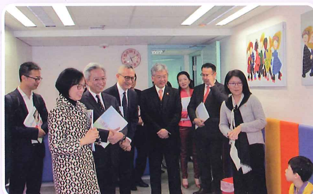
局長們及一眾嘉賓參觀聯合情緒健康教育中心時，與小朋友輕鬆對談 The Secretaries and other guests had a friendly chat with children at United Centre of Emotional Health and Positive Living