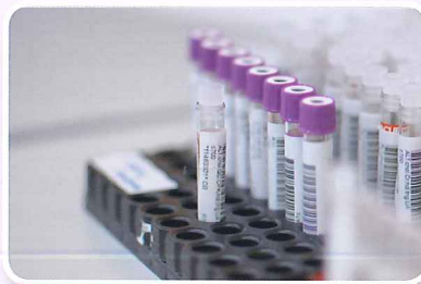
病理化驗所配合先進的化驗器材，為醫生提供專業及有效率的化驗服務 Equipped with advanced and state-of-the-art equipment, Pathology Laboratory provides fast, accurate and precise medical laboratory reports for doctors