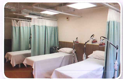
中醫專科醫療中心以合理的價格為市民提供一站式之中醫專病診療及治未病服務 Chinese Medicine Specialty Centre provides one-stop Chinese medicine specialty curative and preventive services at reasonable prices