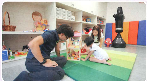
聯合情緒健康教育中心設有專門為有特殊教育需要之兒童而設的遊戲治療室 United Centre of Emotional Health and Positive Living had a game therapy room for children with special educational needs (SEN)