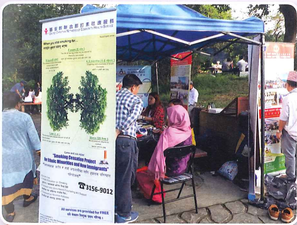
少數族裔及新移民戒煙計劃，為其提供適切的基層健康資訊 Smoking cessation project for ethnic minorities and new immigrants to provide them with primary health information

Apart from clinical psychological counselling and assessment service to the public, United Centre of Emotional Health and Positive Living is equipped with a game therapy room to provide appropriate and professional counselling service for children with special educational needs (SEN) and their families. Sponsored by Wing Ming Foundation, those eligible can receive the necessary services. In 2018-19, the beneficiaries recorded with an attendance of 462.