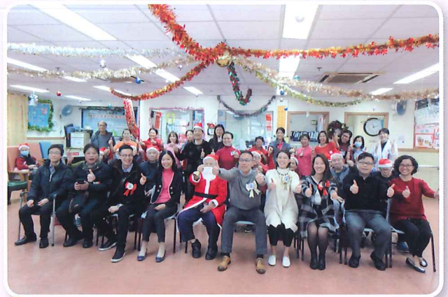
亨達集團到訪鯉魚門長者日間護理中心，與長者預早慶祝聖誕節 Hantec Group visited Lei Yue Mun Day Care Centre for the Elderly to celebrate Christmas with our elderly members

UCN's Social Service joined hands with Hantec Group and Alliance Construction Materials Limited for Christmas celebration with elderly members of Lei Yue Mun Day Care Centre for the Elderly (DE) and Good Neighbour Network (Kwong Fuk) (KFGNN) on 18 and 19 December 2018 respectively. Before the Christmas party, Hantec Group sponsored painting class and cooking class for DE members. Elderly learned to make cookies and painted a picture together as a souvenir for Hantec Group. Besides playing games and giving Christmas presents to the members of KFGNN, volunteer of Alliance Construction Materials Limited also performed a singing/ dancing show which put the atmosphere to the highest point. Everyone enjoyed and had a lot of fun. A total of 153 elderly members were benefited.