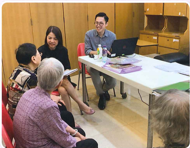
社區營養服務提供外展營養師到診服務至院舍診症 Registered dietitians from Community Nutrition Service provided outreach nutrition service to residential nursing homes