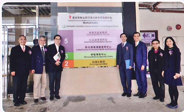
一眾嘉賓在社康醫療中心地下合照 Guests had photo taking on the ground floor of UCN Medical Centre