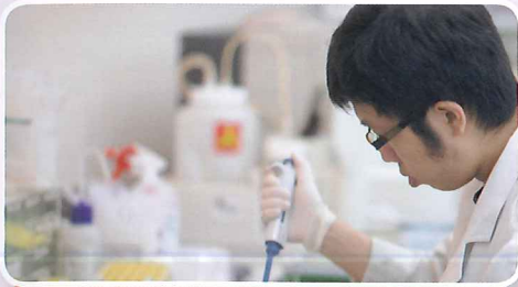
病理化驗所座落於社康醫療中心的二樓，由獲專業資格的化驗人員主理 Pathology Laboratory is located at 2/F of UCN Medical Centre and run by a team of certified professionals

Besides the new Medical Centre, we have a new look for Jordan Health Centre that had its renovation works completed in April 2018. With the restructuring of the organisation chart and upgrade of service facilities, we shall strive to further improve and develop primary health service to achieve our mission of "Leading a Healthy Life".