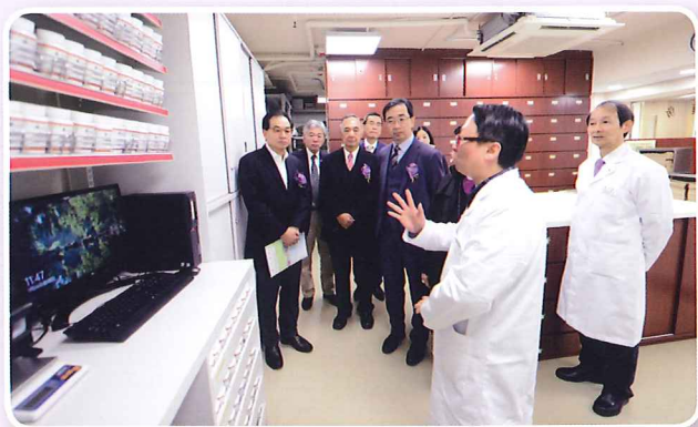
一眾嘉賓參觀中醫專科醫療中心 The guests visited the Chinese Medicine Specialty Centre